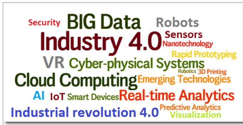
Figure 2: The Fourth Industrial Revolution pillars